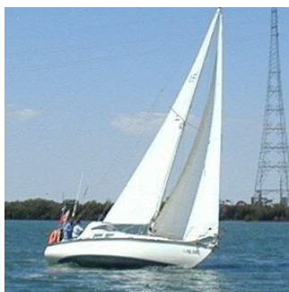
Oh what a feeling!

A personal memory for the editor of this newsletter is the look of fear on the passengers aboard the yacht "Matuki", as she motored out of the basin, skippered by their multi-skilled TADSA Office Manager! Thankfully, I did return with everyone still on board.