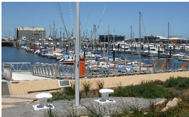
View from PASC – easy access for disabilities